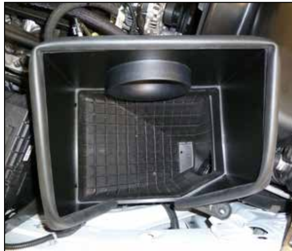
14. Install the heat shield assembly onto the factory lower air filter housing and secure with the seven screws provided.