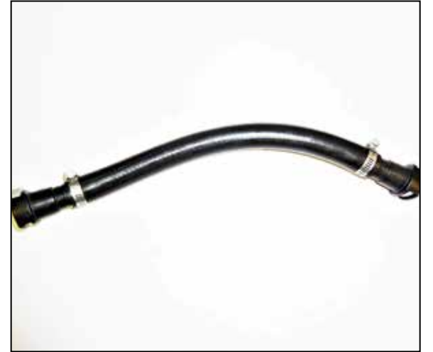
18. Assemble the CCV hose with the fittings, hose and clamps provided.