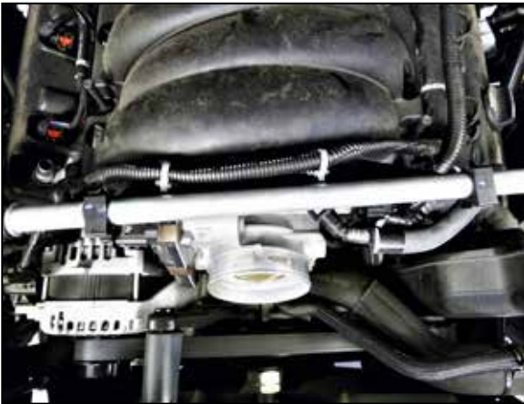
9. Secure the wiring harness and coolant pipe to the mounting bracket as shown.