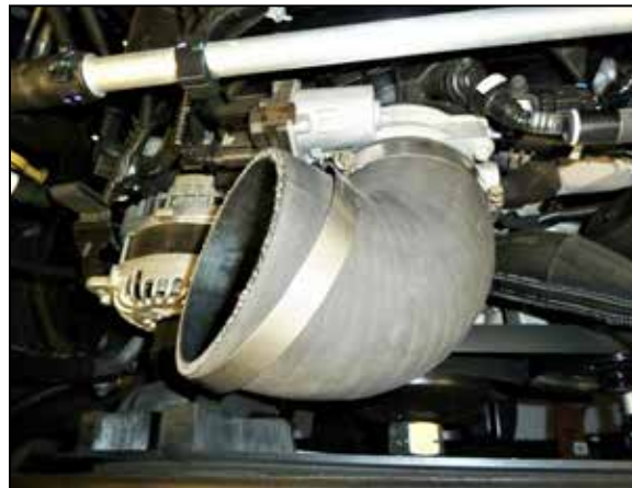
15. Install the angled coupler onto the throttle body but do not tighten the hose clamp at this time.