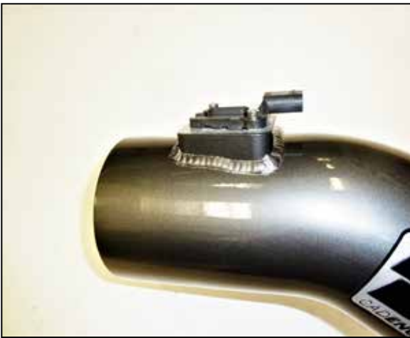
10. Remove the mass air sensor from the factory air filter housing and install it using the provided hardware.