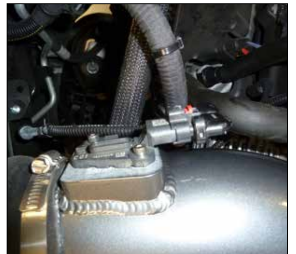
20. Reconnect the mass air sensor electrical connection.