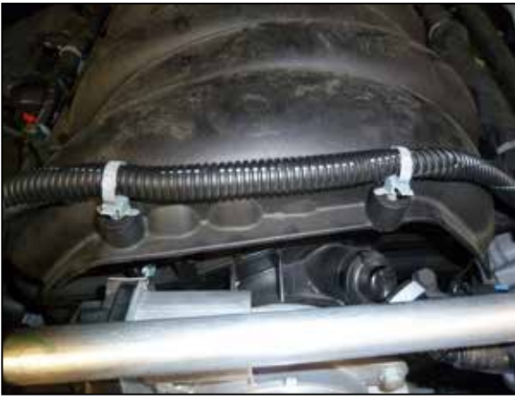
7. Disconnect the wiring harness from the intake manifold.