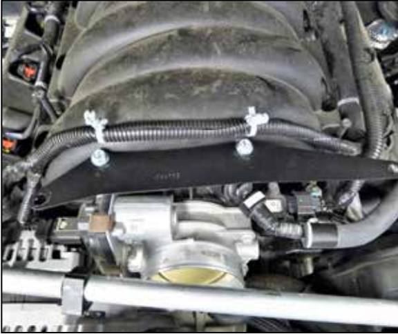
8. Install the provided mounting bracket onto the intake manifold using the provided hardware.