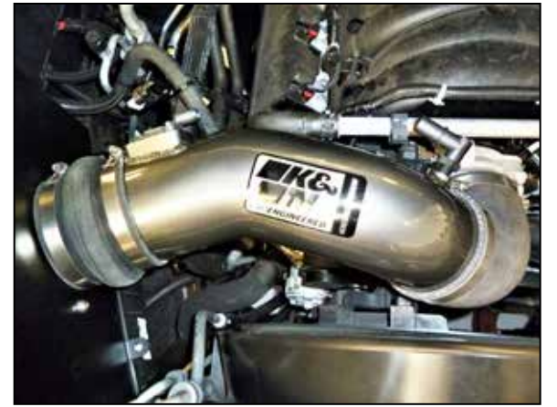
17. Install the intake tube into the couplers, adjust the coupler and tube for best fit and then secure with the provided hose clamps.