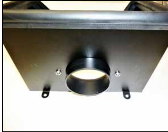
13. Install the filter adapter into the heat shield and secure with the provided hardware.