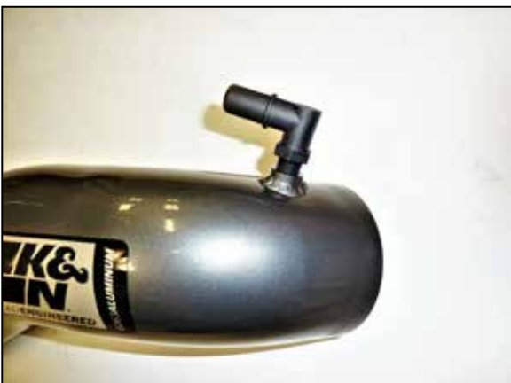
11. Install the provided 90deg quick connect fitting into the K&N intake tube as shown.