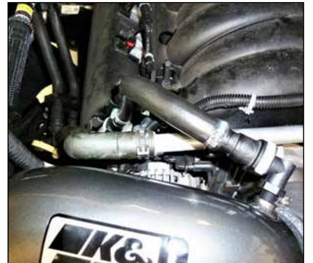
19. Connect the CCV hose assembly to the valve cover and intake tube fittings.