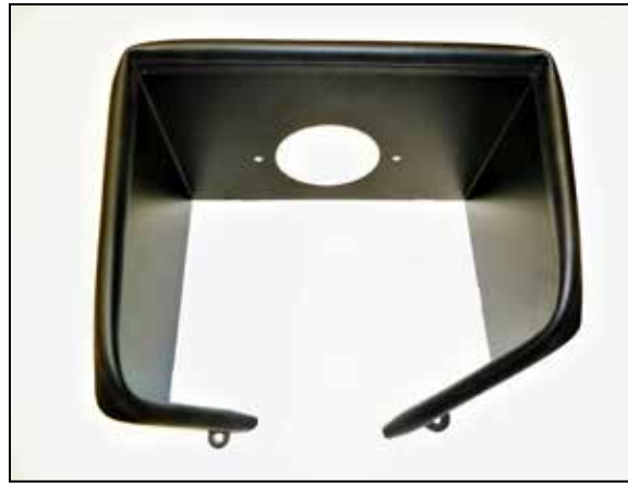
12. Install the provided edge trim onto the heat shield as shown. Some trimming of the edge trim will be necessary.