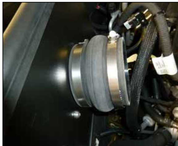
16. Install the hump coupler onto the filter adapter and secure with the provided hose clamp.